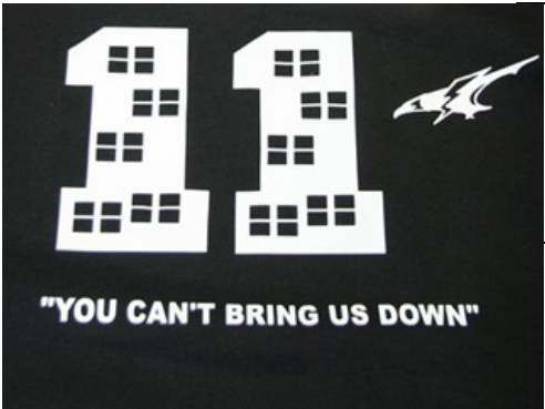
9/11 graphic on the shirts of the junior students.

bombing attempt by a Muslim terrorist on Christmas Day. The terrorist's flight destination was Detroit. Suspensions are not planned, though the students are still meeting with school officials to discuss the matter.